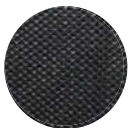
Black Micro Mesh