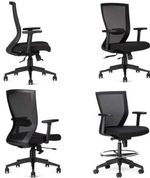
* Stool Kit Pictured

*Seat available in a variety of colors ($158 upcharge)